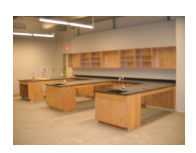
6. Science casework underway