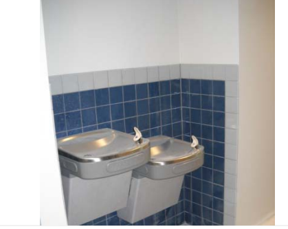
8. Drinking fountains installed