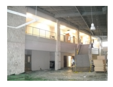
4. Conc. Stain protection in place