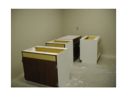
5. Casework staged for installation