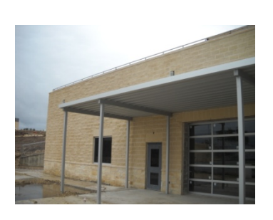
1. Area E canopy & overhead doors