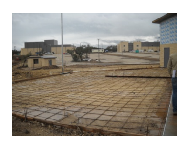
3. Baseball Flatwork prepped