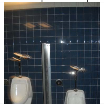
7. Toilet fixtures & accessories installation underway