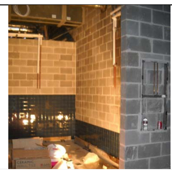
2. Ceramic tile installation underway